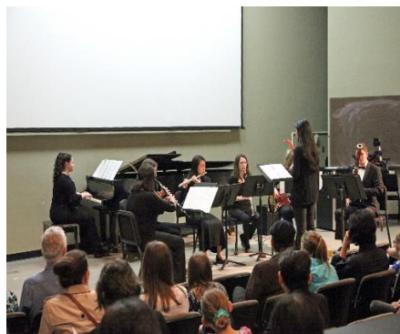
'Road to Nowhere' Performance Ensemble